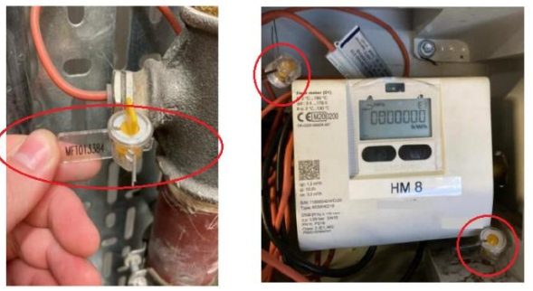
Figure 4: Above extract from SEAI SSRH tagging guidance document currently available on request Where multiple meters are included, describe the method to calculate eligible heat including a formula for addition of all eligible heat and subtraction of ineligible heat meters, e.g., HM1 + HM2 – HM3 = HM<sub>eligible</sub>.